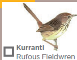
Kurrantl Rufous Fieldwren