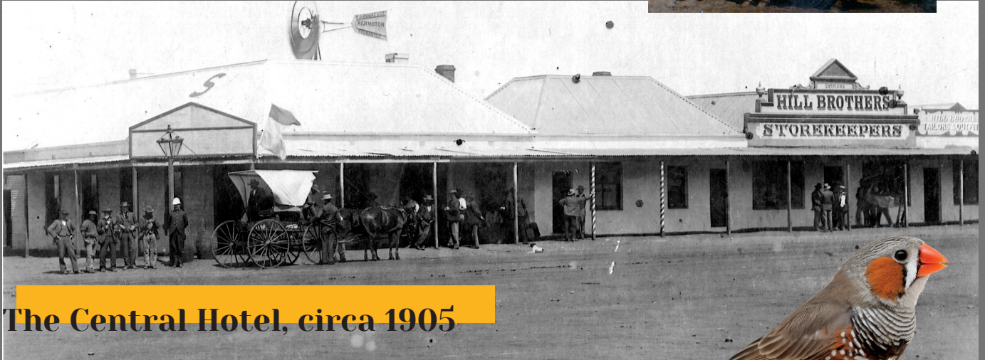
The Central Hotel, circa 1905