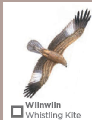
Wilnwliln Whistling Kite