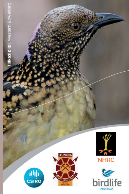
Tjilka:llpilpi, Western Bowerbird