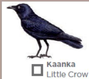
Kaanka Little Crow